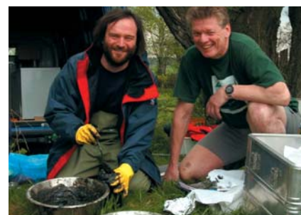
Sediment sampling at the River Elbe in P elou (Czech Republic)

the UFZ Centre for Environmental Research in Leipzig (Germany) have come together for 5 years to develop and integrate advanced analytical and bioanalytical tools as well as interlinked and verified diagnostic and predictive models to unravel causal relationships between contamination and ecological quality and to assess risks to aquatic ecosystems. This goal is being addressed by looking at the three example river basins of the Llobregat (Spain), the Scheldt (France, Belgium and The Netherlands), and the Elbe (Czech Republic and Germany) and is to be achieved by two closely interlinked approaches: