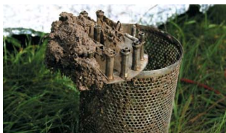
SPMD for passive sampling of lipophilic organic compounds after three weeks of exposure in the River Elbe close to Pardubice (Czech Republic)

There are enormous amounts of monitoring data on contamination, ecology, effects and hydrology that are frequently collected by water agencies and scientific projects and stored locally. MODELKEY is compiling them in one central database and making them available for European scale effect and risk modelling. A kit of modelling tools will