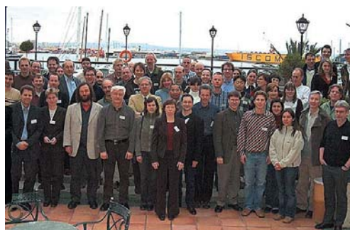
Kick-off meeting in Palma