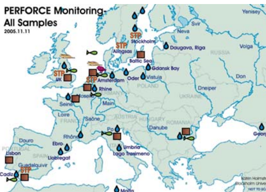
Figure 1: Overview of sampling location and sample types collected in the PERFORCE monitoring programme.

scientific leader in environmental research and exposure assessment for PFAS. Work is split between developing new chemical analytical